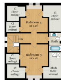
UPPER LEVEL 2 530 SQ FT - Finished 495 SQ FT - Unfinished