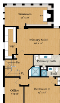
UPPER LEVEL 1 1,170 SQ FT