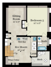
LOWER LEVEL 2 805 SQ FT