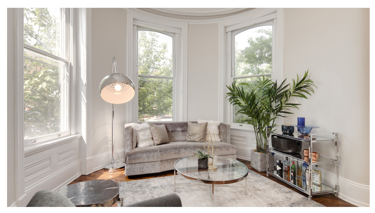
4 BED | 3.5 BATH | GARAGE PARKING